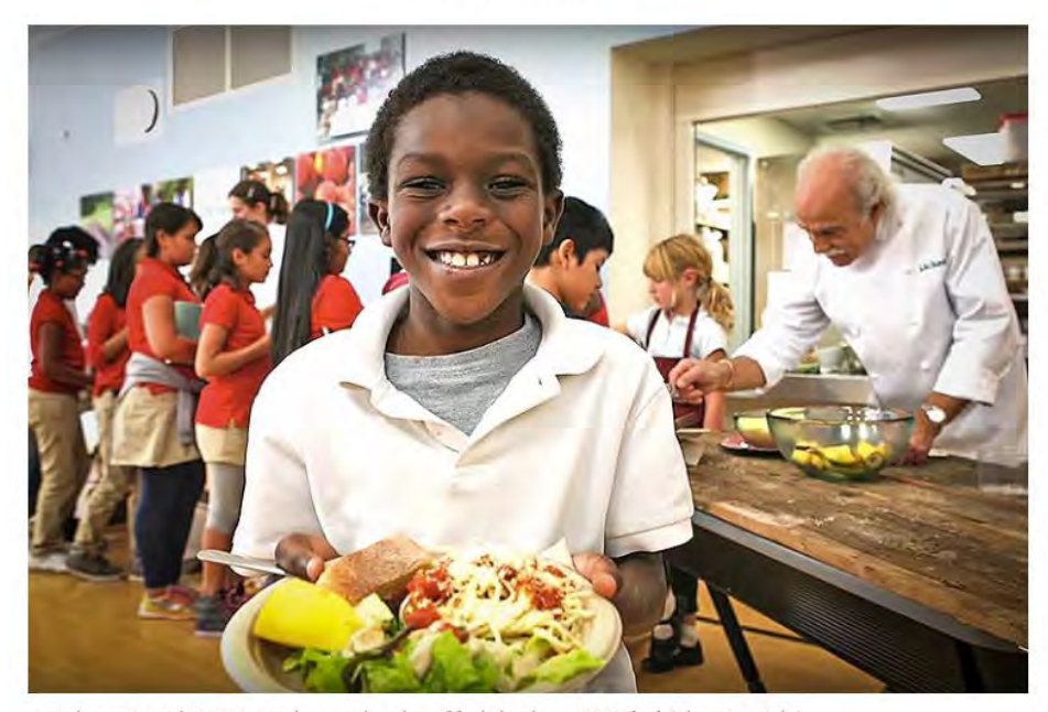
A student at Bayside MLK Jr. Academy with a plate of fresh, local, non-GMO food.

Marin County's school district is the first to make the shift—and it is largely low-income kids who will benefit.